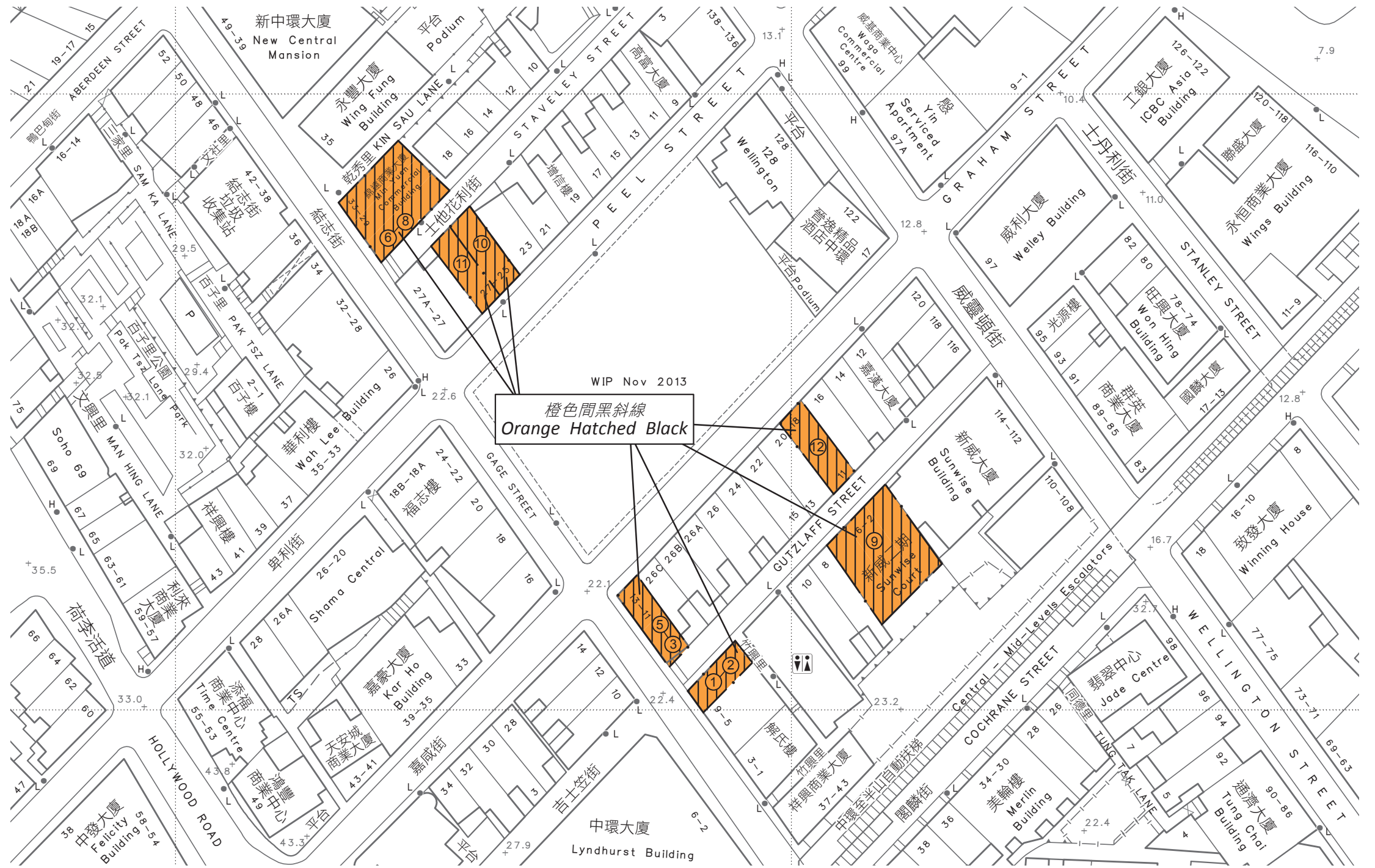
將予收回土地的不分割份數以橙色間黑斜線標示 COLOURED ORANGE HATCHED BLACK AREAS IN WHICH UNDIVIDED SHARES ARE TO BE RESUMED