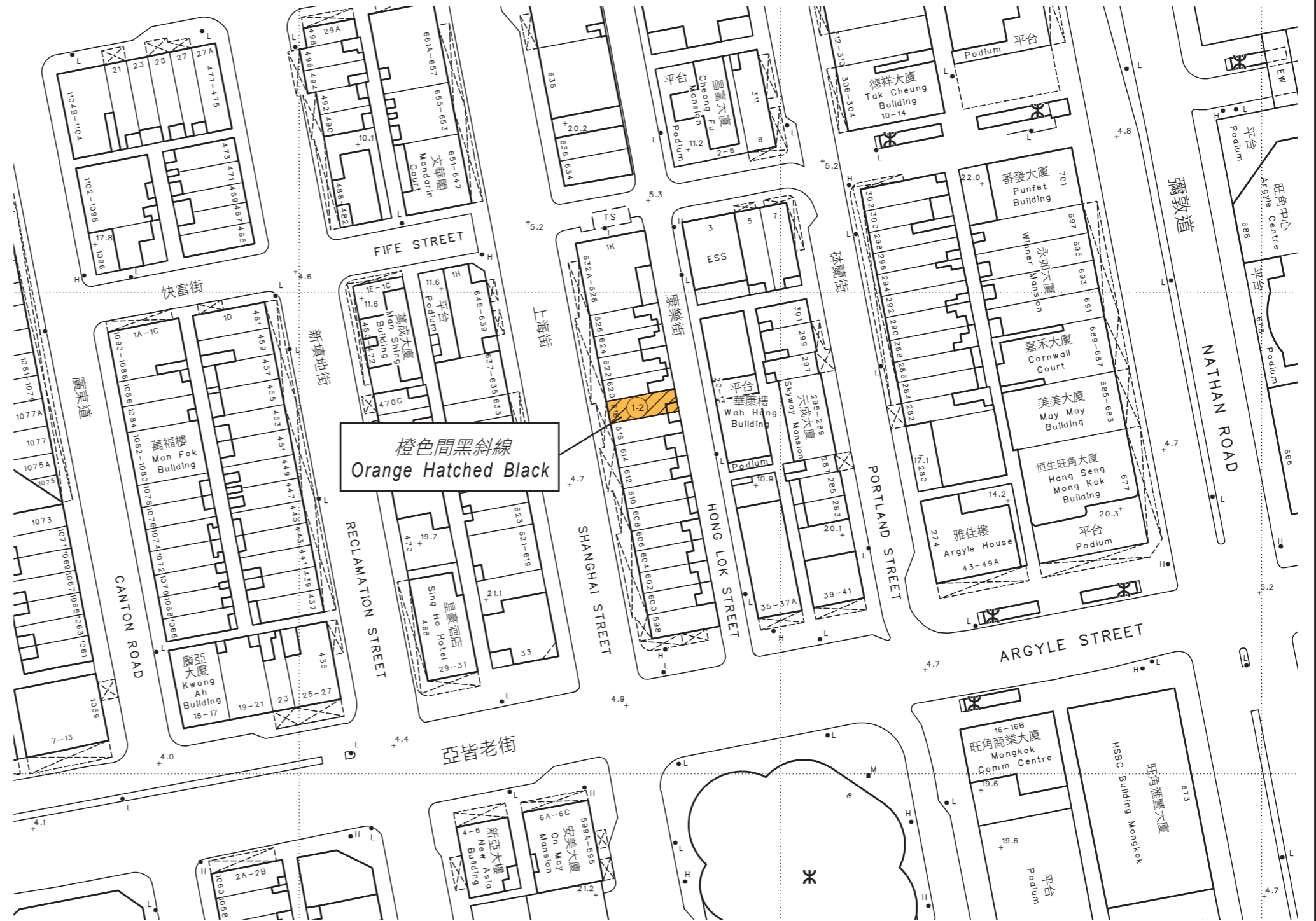
將予收回的土地不分割份數以橙色間黑斜線標示 COLOURED ORANGE HATCHED BLACK AREA IN WHICH UNDIVIDED SHARES ARE TO BE RESUMED