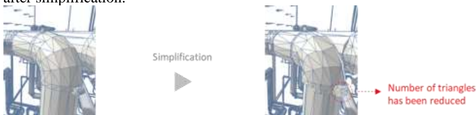
Figure 5. Simplifying the mesh by reducing the number of vertices and triangles.

The file size can be reduced through mesh simplification. For instance, a hollow profile object with thousands of faces can be simplified to a simple solid profile object with less faces. This usually can be done from a BIM authoring tool and some authoring tools have options for choosing the granularity of 3D objects. The figure below shows an example of a mesh simplification for pipe objects. The number of triangles has been reduced on the right side after simplification.