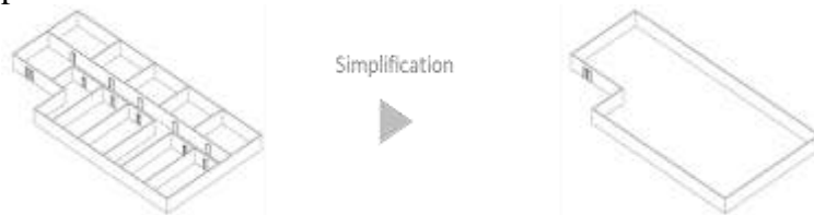
Figure 4. Simplifying BIM by using an algorithm excluding interior IFC objects.

In such a case, visibility checks can be done at multiple points outside the building and if a certain object is assessed to be visible from outside, those objects can remain and other objects can be excluded. The prototype we have adopted for open BIM DR has included this functionality, which makes the prototype less computationally expensive and improving the performance.