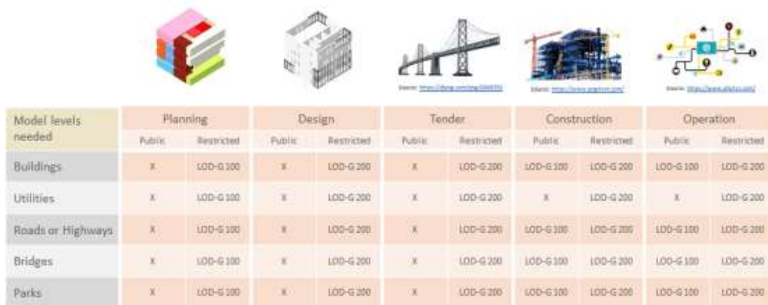
Figure 3. Minimum LOD-Gs for each project stage.

CIC has completed a study in 2021 on the 3D and BIM Data Use Case Requirements of the Construction Industry for the Development of Digital Hong Kong. The project distilled and consolidated 10 potential use cases of BIM/GIS integration from 47 use cases. We try to stock take the proposed minimum LODs required for the 10 use cases to see the possible demand for different LODs in the BIM DR below.