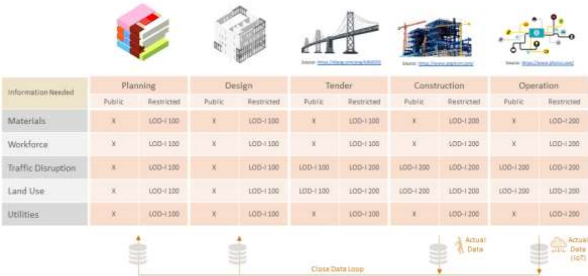
Figure 2. Minimum LOD-Is for each project stage.

The entries in Figure 2 are our initial assessments on the minimum LOD-Is required for different stages in a project life cycle. Even with a low level of development, decision support information can be formulated. For instance, during the Planning and Design phases, LOD-I 100 (e.g. GFA or volume of a building) can parametrically provide a ballpark estimate of the “general” workers’ workhours needed (decision-support information). And the general workers work hours used during the Planning and Design stages can be validated and refined against the actual workhours collected during the Construction phase. The validated and refined metric can be used for future Planning and Design stages. AIA (2008) notes 3D object (referred to as Model Elements in AIA (2008)) at LOD100 may be used for analyses that are based on volume, area and orientation, such as developing cost estimate based on current area and volume; and they may also be used for project phasing and determination of overall project duration. Hence, meaningful information, such as volume and area, can be derived from 3D objects at LOD100 alone and such information can be useful for a large-scale analysis on a city level, e.g. analysis for urban planning.