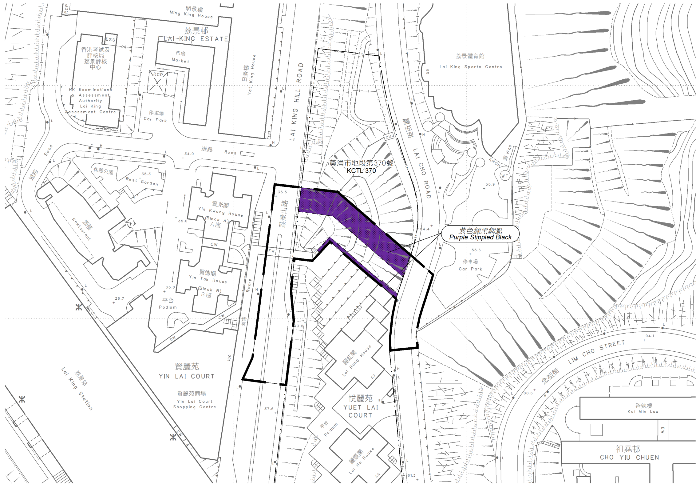
比例尺 SCALE 1:1 000