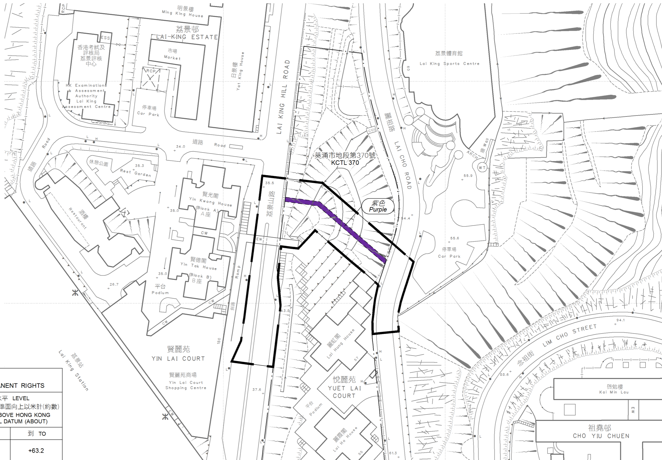
比例尺 SCALE 1:1 000