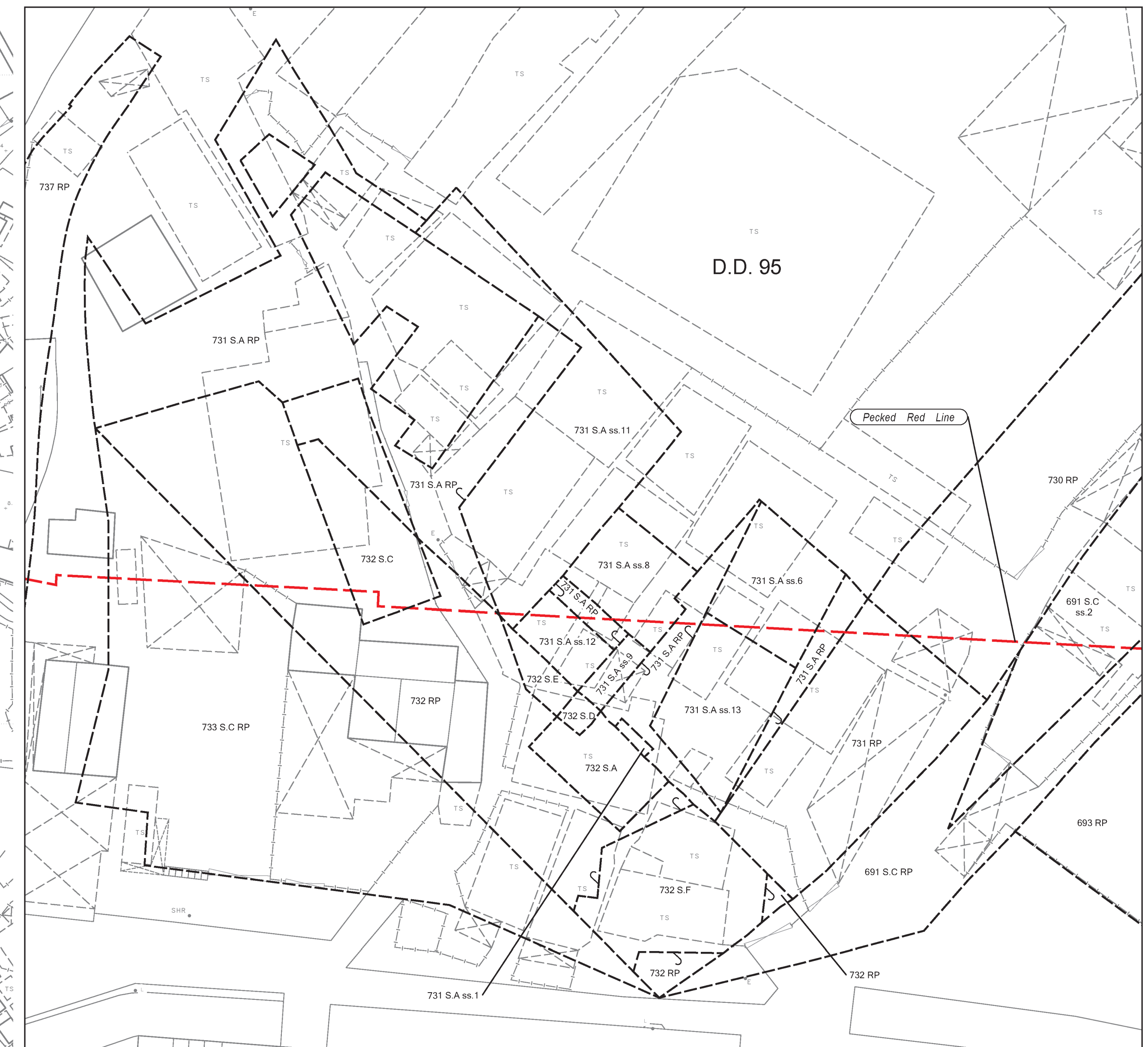
不依比例 NOT TO SCALE