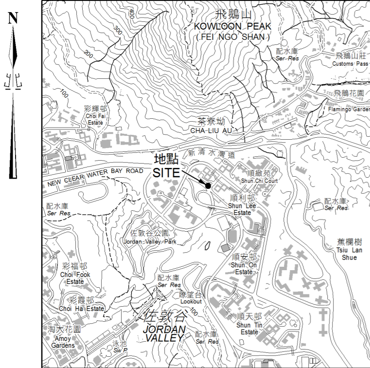
比例 SCALE 1:20 000

在新九龍內地第6465號內設定 暫時佔用土地權利的範圍 AREA IN N.K.I.L. 6465 FOR CREATION OF RIGHTS OF TEMPORARY OCCUPATION OF LAND