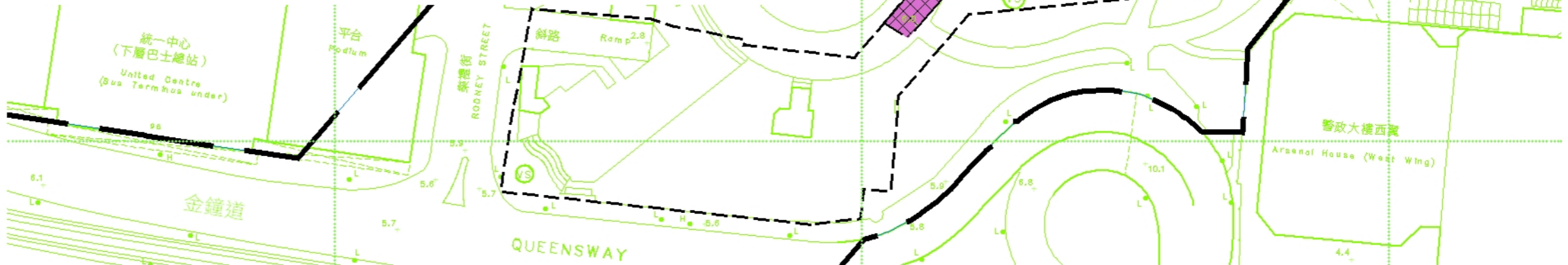
比例尺 SCALE 1:1 000 metres 20 0 20 40 60 80 100 metres