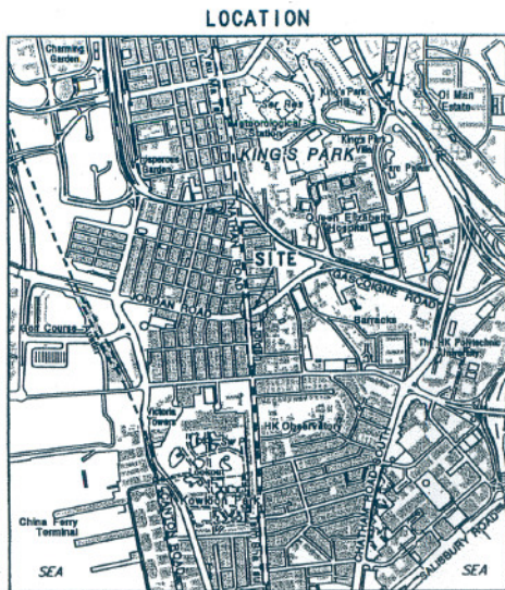
SCALE 1 : 20000

TEMPORARY WORKS ABOVE GROUND AND UNDERGROUND