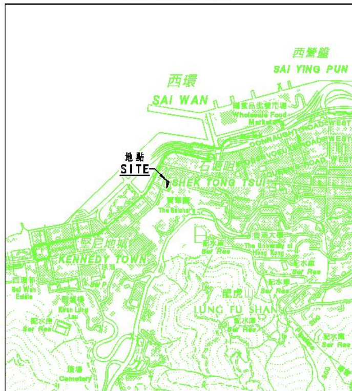
比例 SCALE 1:20000